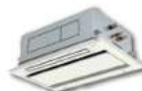
2-way cassette type