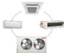
Flexi split AC