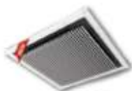
Silent-Iconic™ 4-way cassette type