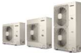
SET FREE mini