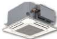
4-way compact cassette type