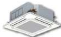
4-way cassette type