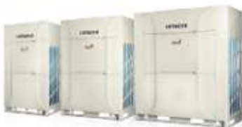
SET FREE Σ