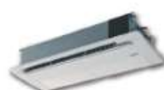
1-way cassette type